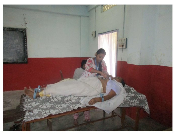
ECG done on a local village woman

People who attended became aware of the importance of such type of health camps and requested for more such programmes in future.