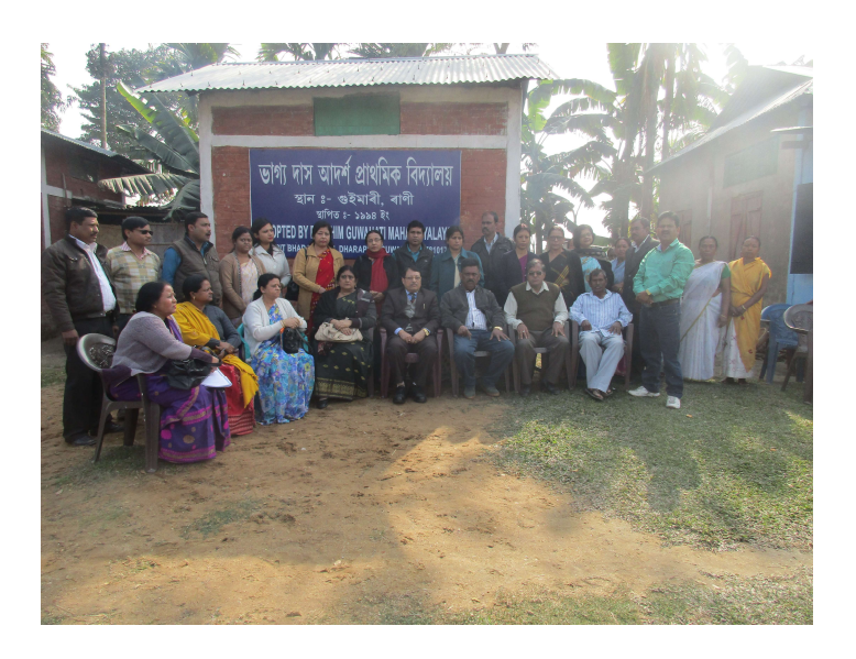
Faculty of the college with some of the community members

It was felt that the requirements for improving the conditions of the school and the village people are many but the fund is limited. Support from the Block Development Office and the Forest Department will be highly helpful. Involvement of more people will also increase the rate of success.