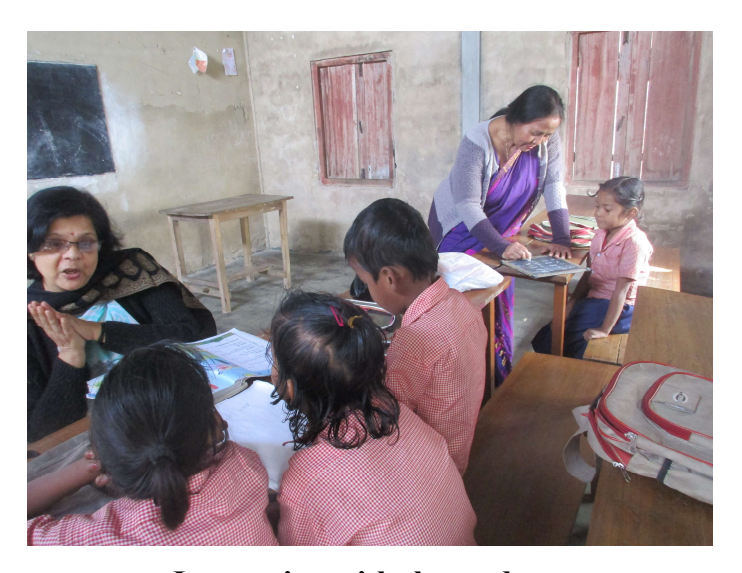
Interaction with the students

These programmes undertaken by our college community can be considered highly successful as the number of people attending the programmes was quite satisfactory. About 150 people including the little students attended the feast. All the people seemed to have enjoyed taking part in the various programmes on that day.