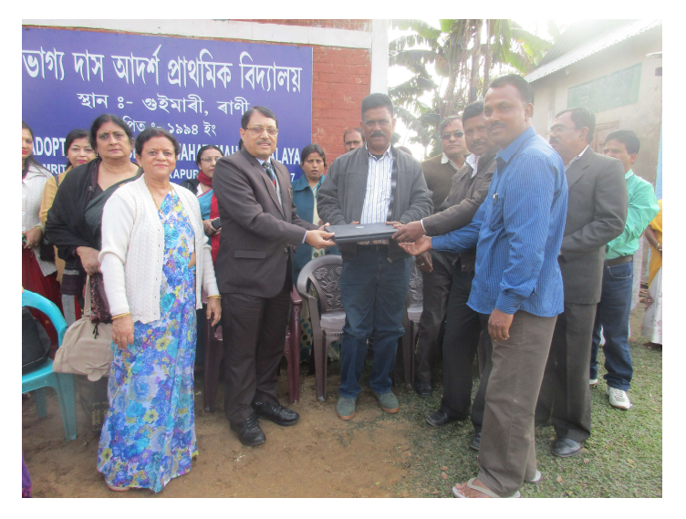
Presenting a laptop to the school authority

provided to the students. On 22<sup>nd</sup> January, 2016 there was also a community feast organised by the college to create a congenial relationship among the local people and the college fraternity. These programmes are highly appreciated by the people of the locality as well as the little students of the school.