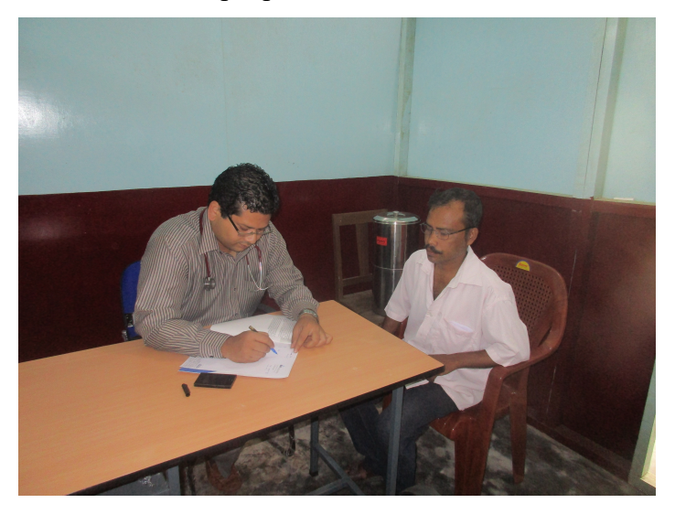
Doctor's advice to a local village person

All sorts of necessary equipments could not be brought to such camps and only initial investigations could be made on the people.